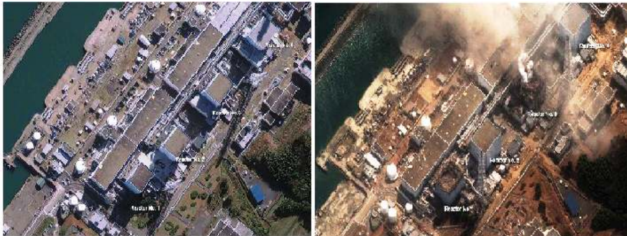
Fig. 3 Fukushima Daiichi reactor before and after explosion

At Tohoku Electric Power Plant, fire broke out and one third of Kesenuma city is submerged by tsunami waters. The Fujinuma irrigation dam in Sukagawa ruptured, causing flooding and destroyed 1,800 homes downstream. At Fukushima Daiichi Nuclear Power Plant No. 1 and No. 3 reactor buildings exploded (Fig. 3) on the alternative days after the Tsunami which has damaged the power supply system to the nuclear plant and further resulted in the failure of cooling system which controls the reactions in the reactors. Substantial damage was caused to the reactor building, including the upper structure being largely destroyed with the building's roof and side panels blown off. The climax of this tragic event was the melting down of two nuclear reactors, which also caused a chemical explosion that prompted immediate evacuations of the affected areas with over 200,000 people being evacuated, especially those who were within a 10km radius of the Fukushima II Nuclear Power Plant and a 20km radius of the Fukushima I Nuclear Power Plant.