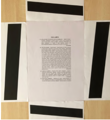
Fig. 1. The figure shows a typical image and the slanted edge arrangement used to create the SFR dataset. The slanted edges are placed on all sides of the document. We use four slanted edges to capture the motion and out-of-focus effects robustly. The degradations in slanted edges due to these factors lead to a low SFR score, which in turn results in a lower ground truth value for all the affected patches.

erties and use of OCR accuracies as ground truth. This led to specific efforts towards DIQA.